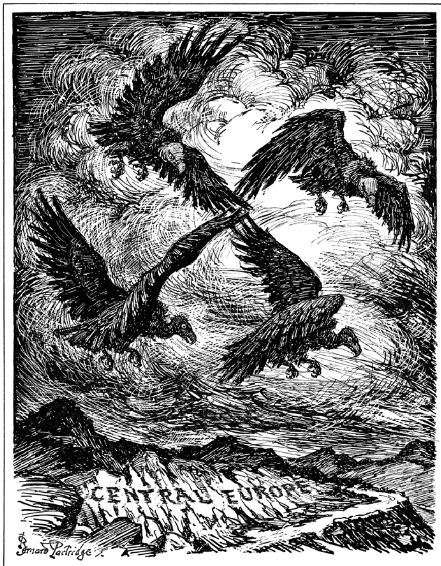
THE GATHERING OF THE VULTURES

A cartoon published in Britain on 22 March 1939.