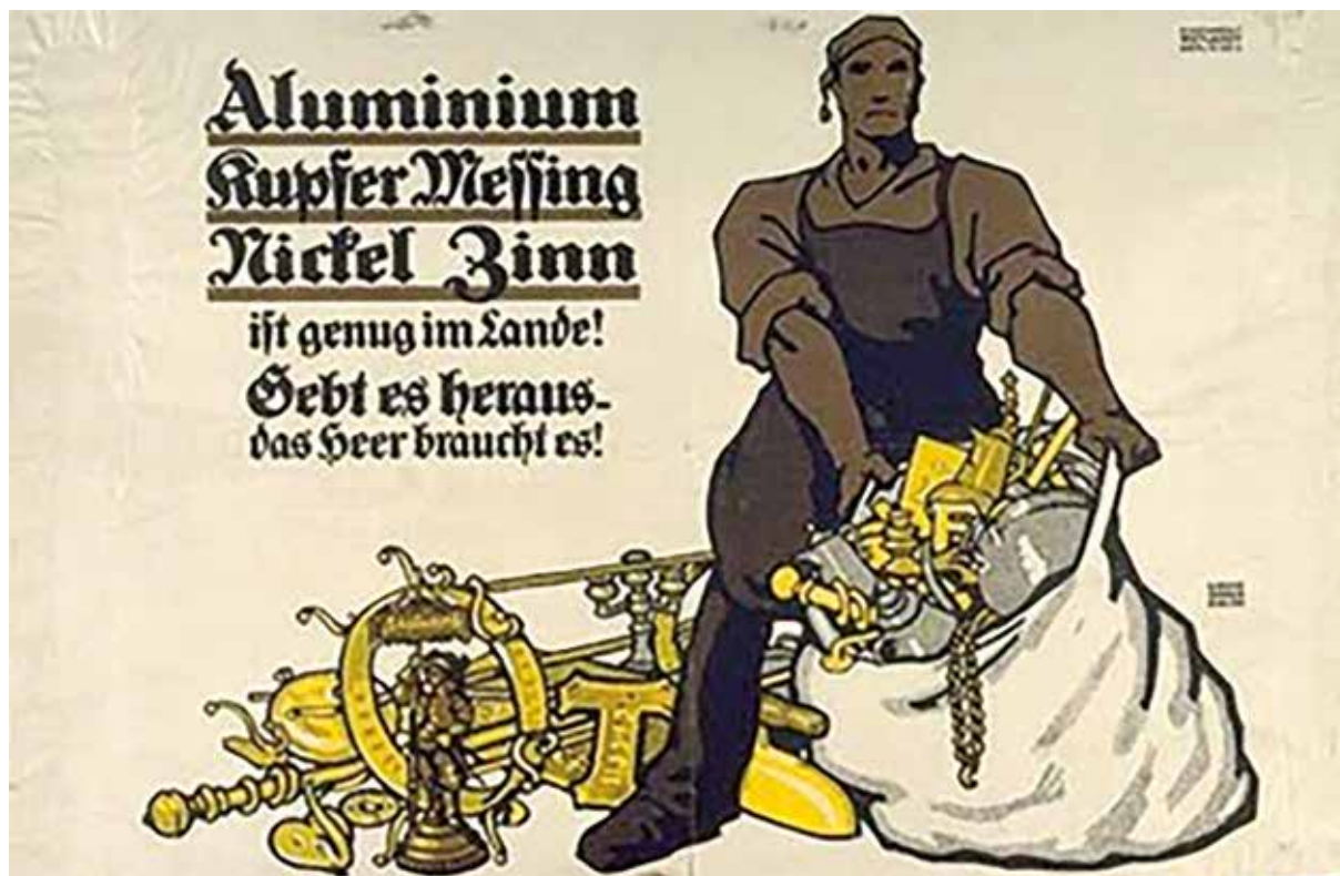
A German poster published in 1918. The words say 'There is enough aluminium, copper, brass, nickel in the country! Hand it over – the army needs it!'