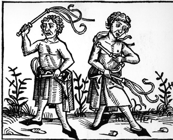
A fourteenth-century drawing of people whipping themselves.