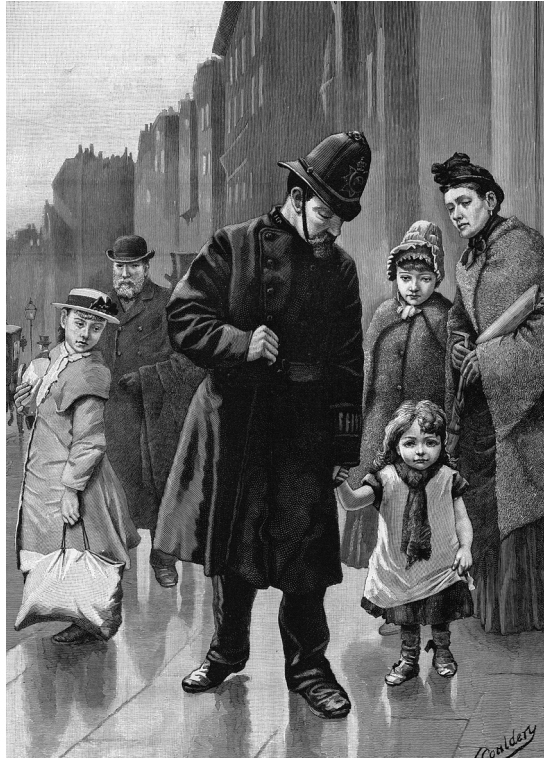
A picture, entitled 'Lost in London', published in a London magazine in 1888.