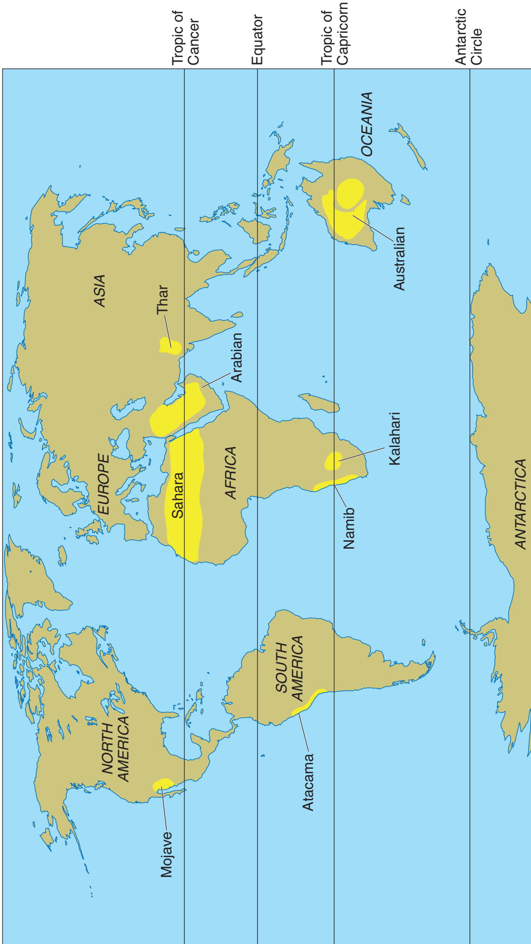
Fig. 1 Global distribution of hot deserts