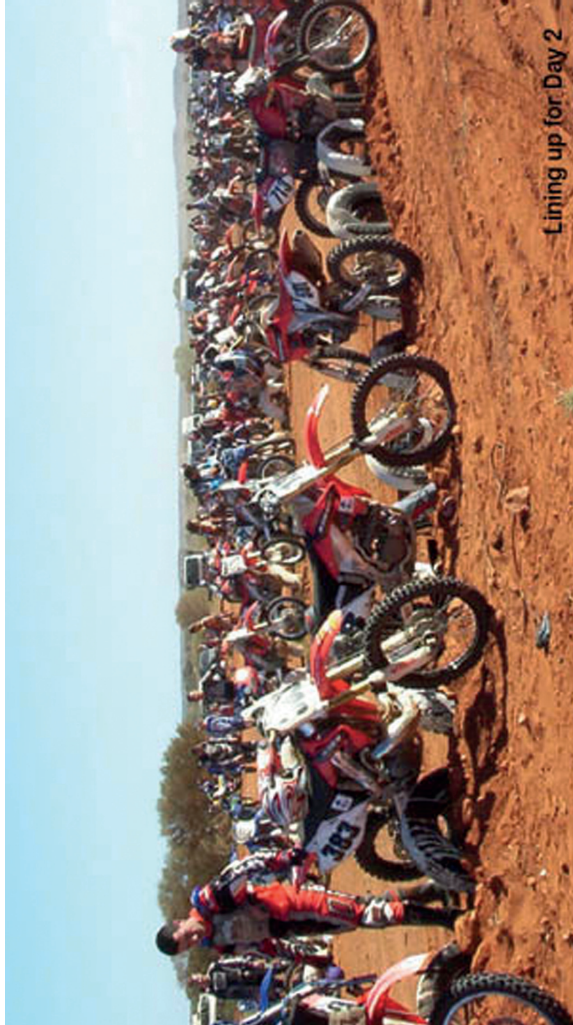
Photograph A – Lining up for Day 2 of the Finke Desert Race