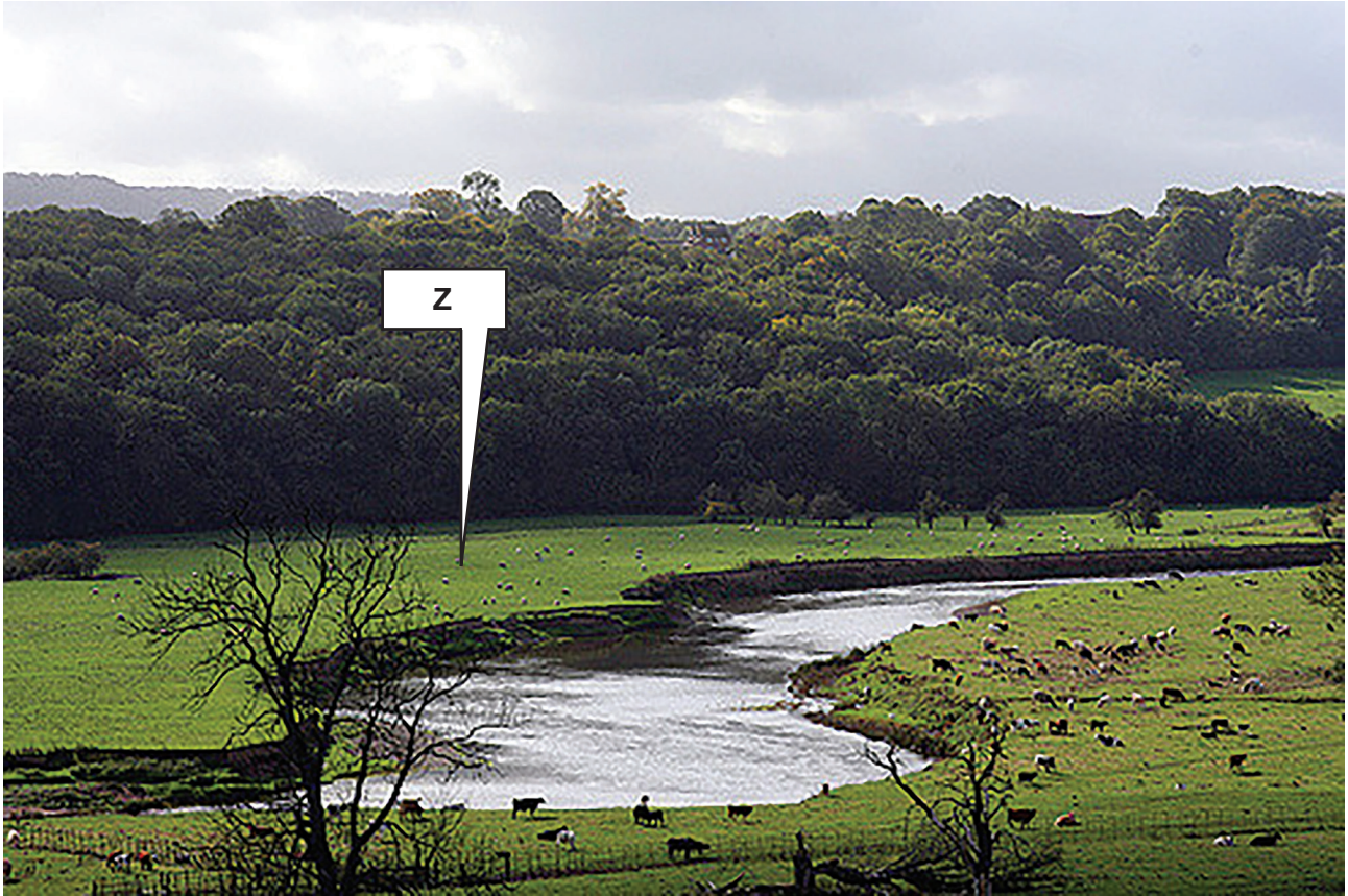
Fig. 2 – Photograph of the River Severn