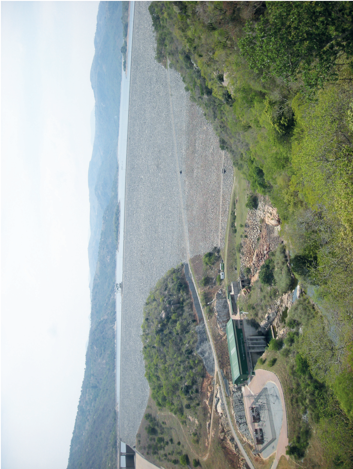
Photograph A for Question 5